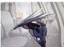
Tilt & telescopic steering