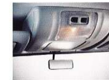
Bigger and stylish room lamp