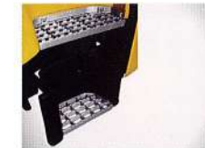
Twin aluminum anti-skid footsteps