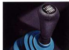
Ergonomically designed gear lever position