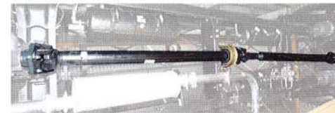
Lubricated for life propeller shaft