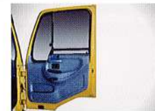
Wider door opening