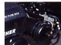
Air processing and distribution assembly for longer life and effective braking