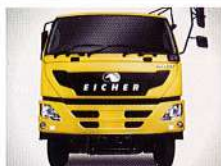
Aerodynamic cabin with new and modern styling