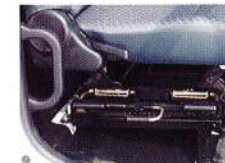
6 way adjustable driver seat