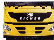
Bigger and stylish integrated head lamps with more light intensity