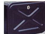
Tool box with lock provision