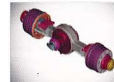
432 mm dia. crown with heavy duty meritor axle