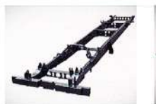
Wider joggled frame Domex chassis with high tensile strength