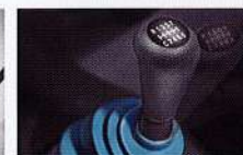
When to change gear