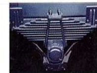
Rear bogie suspension with 10 leaves