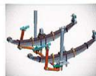
Front suspension with ARB (Anti Roll Bar)