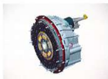
430 mm dia. clutch with clutch booster