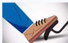
When to accelerate

Fuel coaching system for real time guidance to driver for economical driving practices