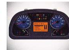
Instrument cluster with LCD display