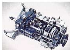
ZF 1110TD, 9S Gear Box